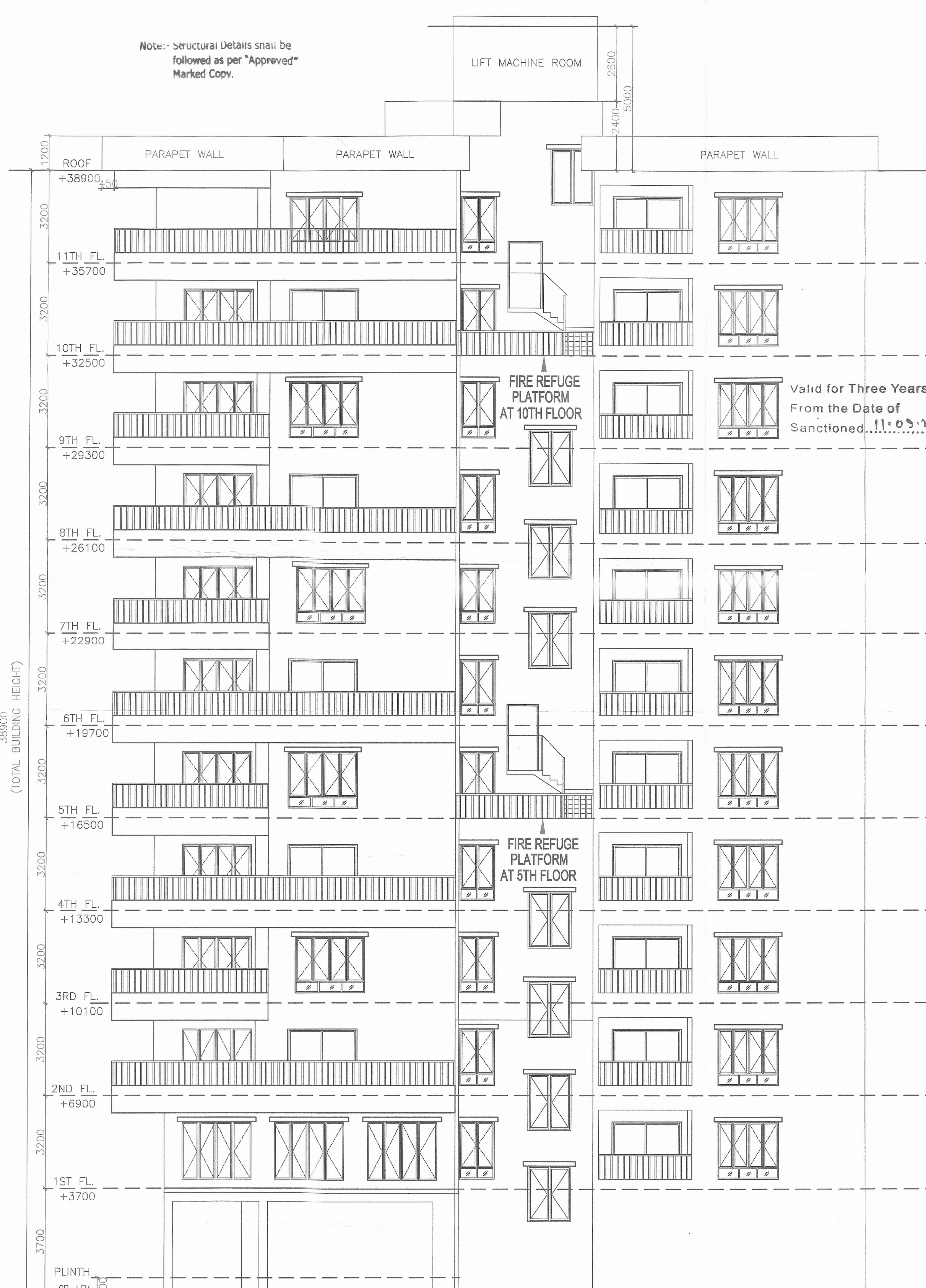
NORTH SIDE ELEVATION RESIDENTIAL BLOCK-01

Mass & Void Architect, Interior & Landscape Consulting 56 Christopher Road, 4th Floor, 4b The Ekta Hibiscus, Kolkata-700 046, P. 033 2328 2264 E. Mava2003@gmail.com, W. www.massandvoid.com